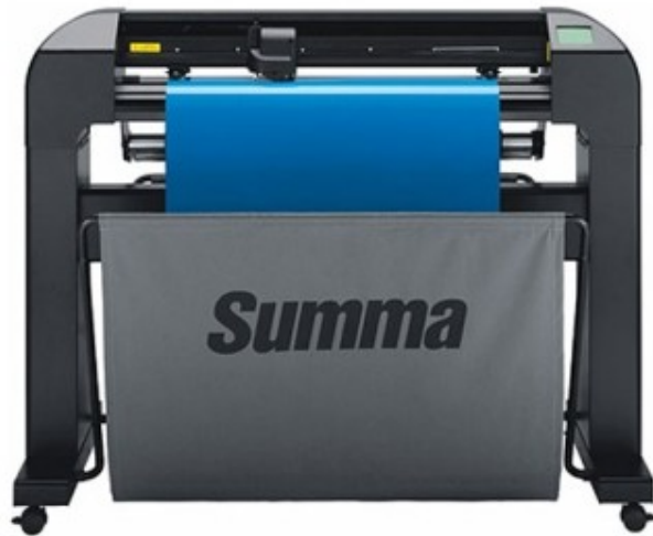
Plotter Summa S75-T

use tangential technology. This technology reaches more fine detail, accuracy on fonts, better quality and wider opportunities to cut through very thick and harder materials.